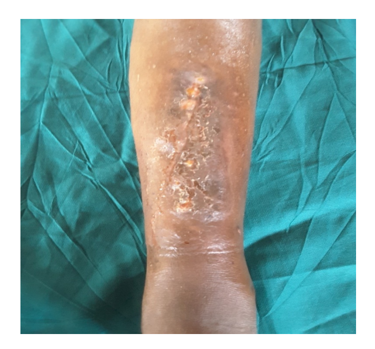
Figure 4: An 18 - month old wound now turned chronic osteomyelitis in a child

Wound healing was achieved in more than half (n=10/19; 52.6%) of the cases by three weeks of commencement of simple wound dressing with local honey. In the others (n=8/10; 42.1%) the healing process was progressing satisfactorily. None of the cases needed referral for more sophisticated dressings or a skin grafting. However the one case (5.3%) with chronic osteomyelitis was referred to a tertiary Health facility for appropriate management.