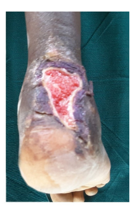
Figure 3: A 6 - month old chronic wound in a child – before and after cleaning