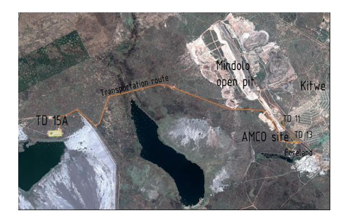
Figure 8: Uranium Tailings at TD 11, TD 13 and TD 15 in Kitwe

In 2009, Copperbelt Environment Project (CEP) spent over US$1.3 million to dispose 40.000 metric tonnes of uranium tailings stored at TD 11 and TD 13 (Figure 8) from mining activities in the 1960s in Kitwe's AMCO community near Mindolo Mine Township. The tailings were a health and environmental hazard to the surrounding area and community and thus required to be relocated. In achieving the sustainability of the storage of the tailings, a public disclosure meeting with Armco residents was held on the movement of the uranium tailings in Kitwe to a disposal site at Mopani Copper Mines dump. The community in Mindolo's Armco compound had been sensitised about the exercise and what to expect and avoid increase of spillage. As a measure to protect the community, a new road had also been constructed in the mine area to be used by the local residents even after the exercise.