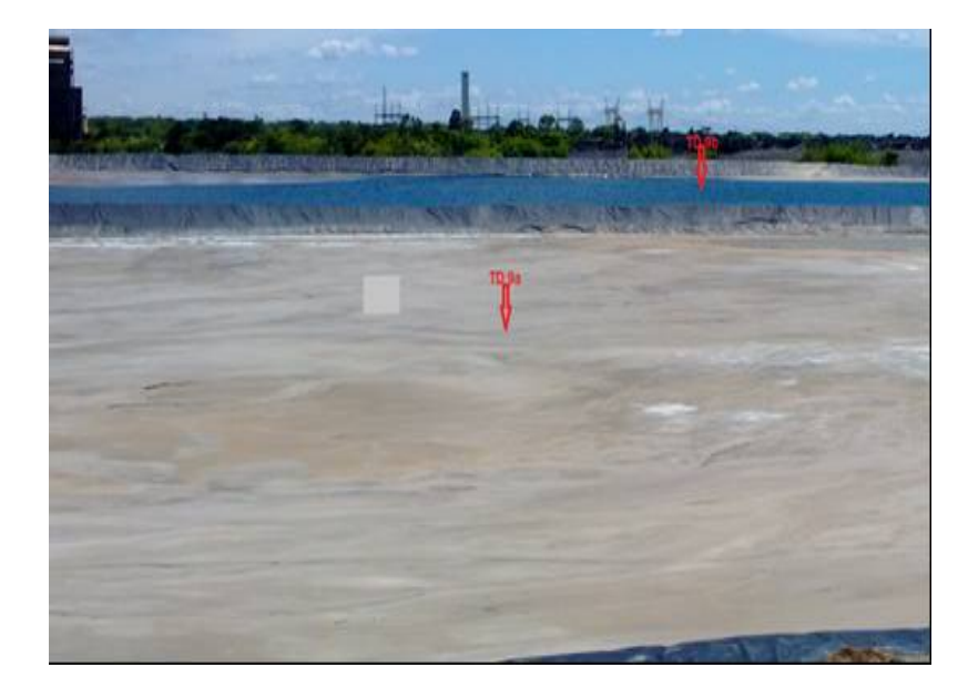
Figure 6: Leach Raffinate clear of solids ready to be pumped back to agitation tanks at Sino Metals Leach Dam