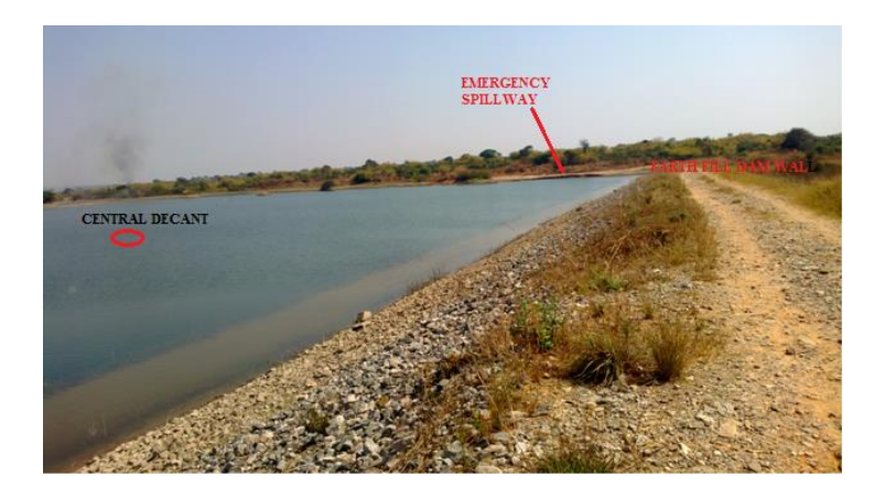
Figure 3: Musakashi Dam in Chambishi

Usually, an impounding dam wall (see Figures 4) is used to restrain the flow of the deposited material and to create a dam of tailings behind the wall. The principle behind these design is to have the slag collect in one place, allow the suspended solids and part of dissolved solids settle to the bottom and clear water is discharged through the central decant or through the spillway at the back of the lake (see Figures 1 through to 4). The emergency spillway is for controlled emergency discharge in the event that uncontrollable situation arises.