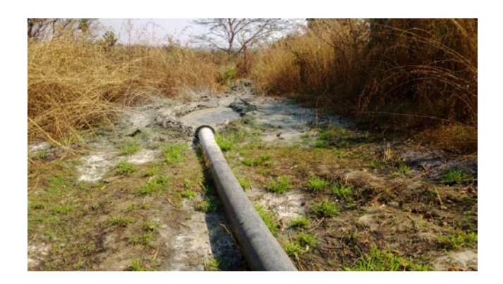
Figure 2: Open-ended Tailings Storage Facility - Musakashi Dam, Chambishi

Usually, an impounding dam wall (see Figures 4) is used to restrain the flow of the deposited material and to create a dam of tailings behind the wall. The principle behind these design is to have the slag collect in one place, allow the suspended solids and part of dissolved solids settle to the bottom and clear water is discharged through the central decant or through the spillway at the back of the lake (see Figures 1 through to 4). The emergency spillway is for controlled emergency discharge in the event that uncontrollable situation arises.