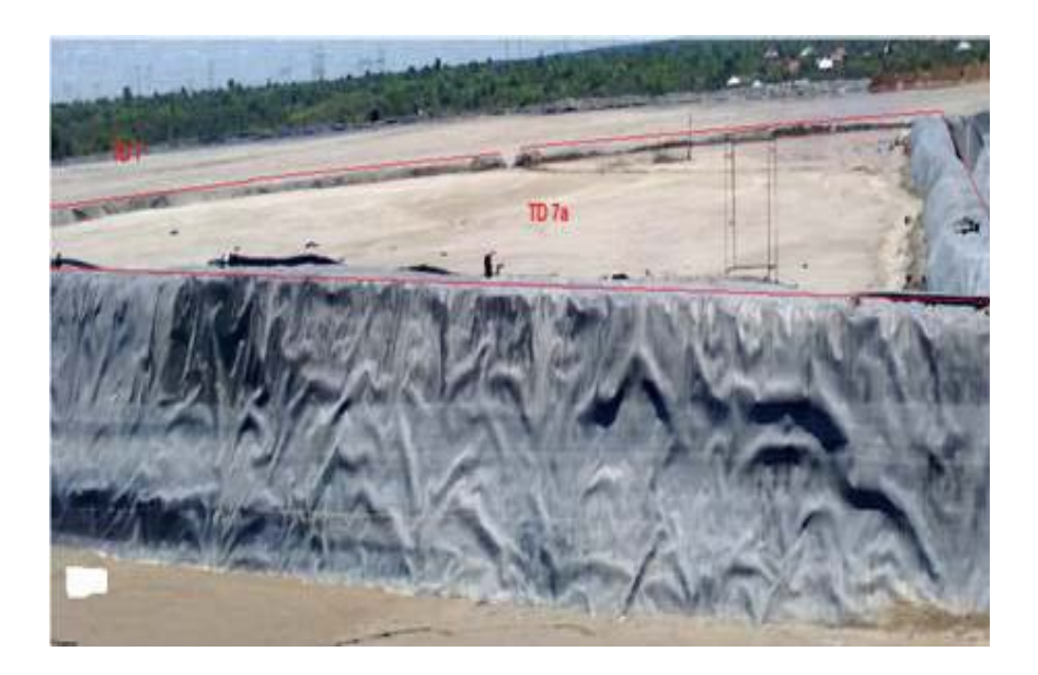
Figure 5: TSF lined with HDPE at Sino Metals Leach Dam

In Zambia, companies operating tailings leach plants have to deal with problems associated with effects of acidic discharge (see Figures 5 through to 7) to the environment in the event of accidental spills of acidic tails. They have to deal with ground water contamination problems in the event that the acidic fluid finds crack or conduits in the ground. The TSFs are normally closed system with only evaporation as the only means by which the fluid is allowed to escape to the environment or depleted from the system. The design involves the excavation to near bedrock and laterite is laid at the base and on the sides and then compacted. This is followed by laying of a geo-membrane to make the dam impervious. The Geomembrain used is usually high density polyethylene (HDPE). When the solids have settled resulting solution is pumped back to the agitation tanks for reuse as the solution is acidic and may contain some leached copper.