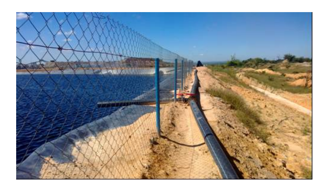
Figure 7: Sino Metals Leach Dam