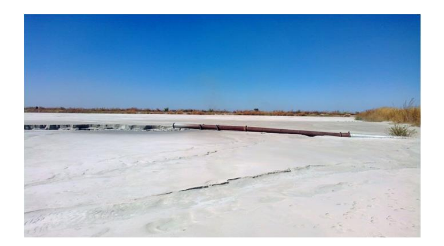
Figure 1: Open-ended Tailings Storage Facility - Musi Dam, Luanshya