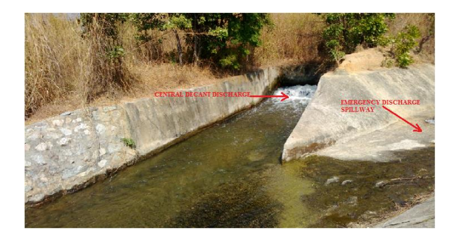
Figure 4: Central Decant Discharge - Musakashi Dam in Chambishi