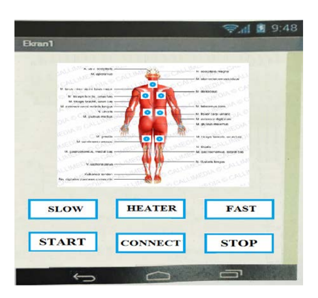
Figure 1: Google App Inventor Interface [15*Picture]

With Google App Inventor application, start, connect, stop slow, heater, fast buttons and buttons for area of neck, shoulder, waist and limb in simulated human body were placed, and the interface design was performed in the way that the information from cell phone to control card about what the process of massage seat will be transferred according to clicked button. This application was preferred for the reason that it enables to develop Android applications simply and fast without needing code information and to use toolbox such as button, textbox, label easily [12].