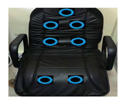
Figure 3: Massage Cushion

Arduino Uno was chosen as control card processor. Arduino Uno has 5 V D.C. working voltage, EEPROM, SRAM properties, PWM pins with digital and analogue pins, and 65*50*1,5 mm sizes. These are the reason to be preferred this control card processor [14].