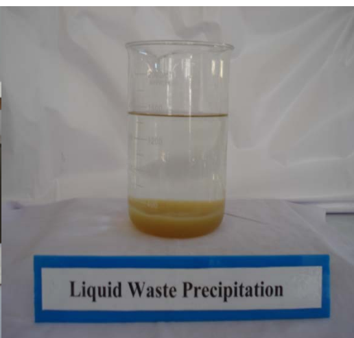
Figure 5: filtered the precipitant