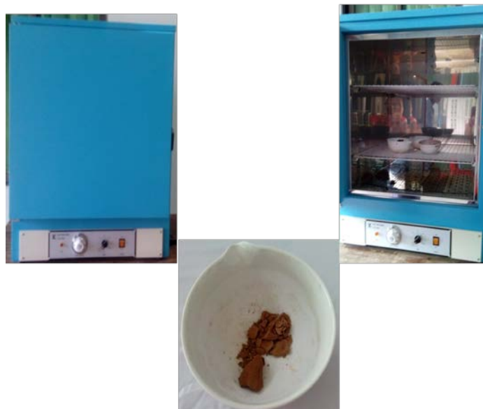
Figure 6: sludge dried in an oven