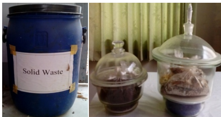
Figure 7: sludge stored in container