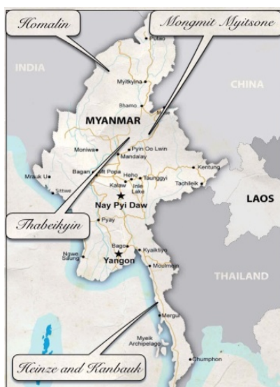
Figure 1: location of regional monazite ores