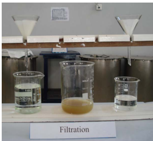
Figure 4: liquid waste precipitation