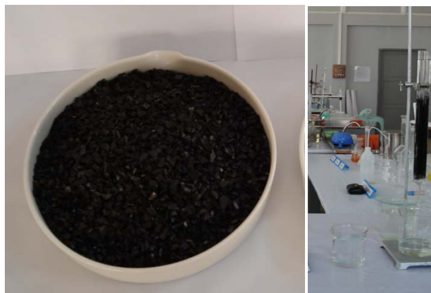
Figure 8: activated carbon and activated carbon column