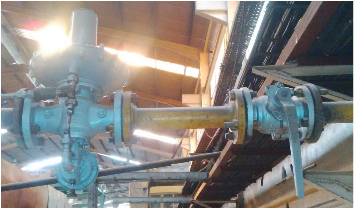
Figure 1: Gas train

Gas train is a combination of electrical components in a gas line pipe that regulates, controls the flow of gas into the burner of the oven. This comprises many components such as pressure switches, gas regulators, filters, solenoid valves etc. all these components work together to regulate oven temperature and provide safety. Figure 1 shows the component of gas train.