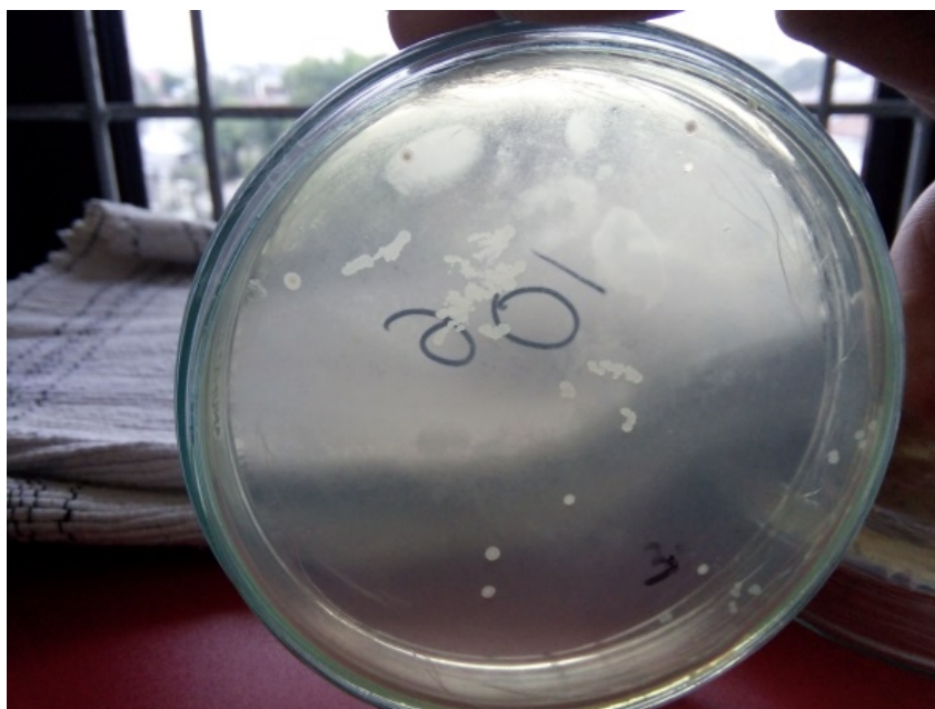
Figure 1: The growth of LAB isolated from raw goat milk on MRS agar

The total colony of LAB from 1 mL raw goat milk was 30 \times 10^6 CFU/mL. The growth of LAB from raw goat milk on the surfaces of MRS agar are shown in Figure 1.