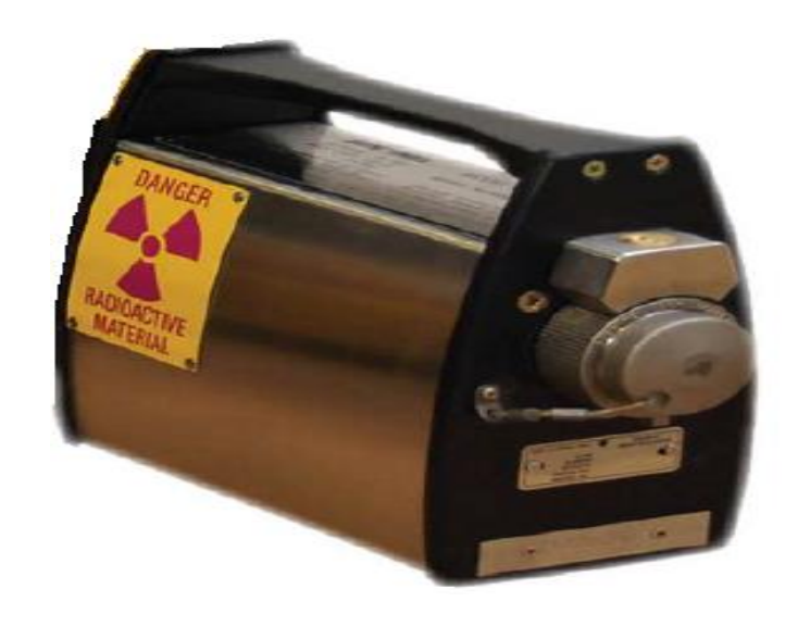
Figure 1: Gamma radiography, the model 660