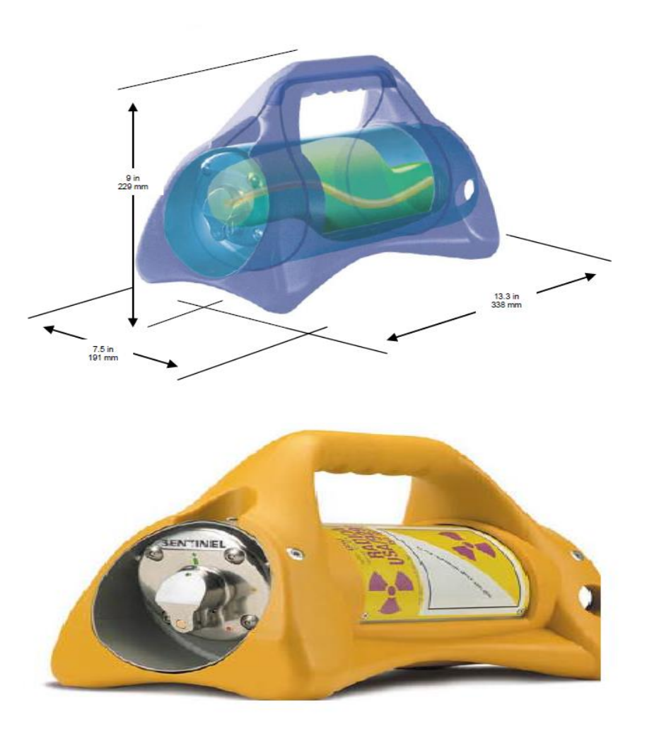
Figure 2: Gamma radiography, the model 880